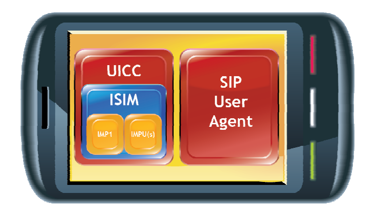
Figure 2 - The IMS-capable UE

The UICC is a smart card that contains one or more applications. In an IMS-capable system the most relevant application is the IP Multimedia Services Identity Module (ISIM) . It includes a permanently allocated global identity called the IP Multimedia Private Identity (IMPI) , the home operator's domain name and the IP Multimedia Public Identity (IMPU) , which is used to request communication with another user. A unique concept in IMS is that a single device may have multiple IMPUs, and multiple devices may share an IMPU.