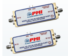
Broadband, High IP Amplifiers for SIGINT