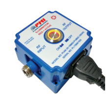
Test Bench & Lab Use Amplifiers