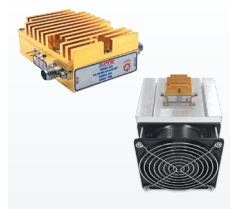
Solid State Power Amplifiers (SSPA)