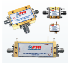
Narrow Band Low Noise Amplifiers (LNAs)