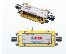
Broadband Low Noise Amplifiers (LNA)

PMI designs and manufactures a full range of solutions for your most demanding RF and Microwave challenges.