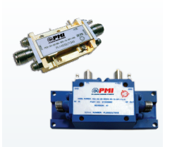
Variable Gain Amplifiers