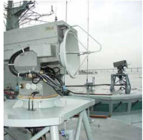
Naval EW application